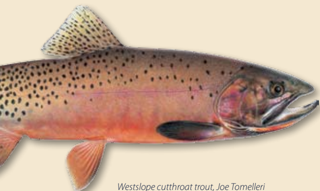
Westslope cutthroat trout, Joe Tomelleri

Currently, seven species of western native trout have been listed as Threatened under the Endangered Species Act, and eight other species have been petitioned at one time or another to be listed as Threatened or Endangered. Increases in management activities are needed to improve the status of these fish.