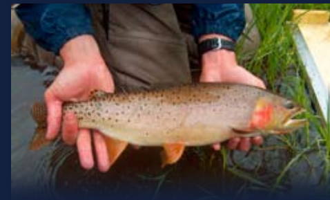
Bonneville cutthroat trout, Trout Unlimited

The Bonneville cutthroat trout: native to a large geographic area, primarily in Utah.