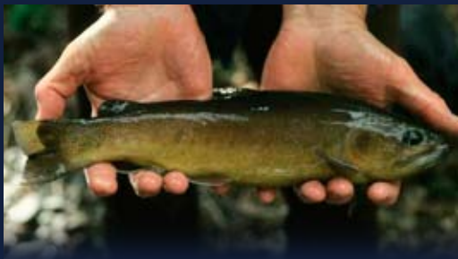
Gila trout

The Gila trout: native to the Gila River, a tributary to the Colorado River in New Mexico and Arizona.