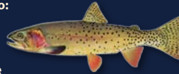
Yellowstone cutthroat trout, Joe Tomelleri

Conservation and management partnerships at the local and regional level will implement key action strategies described in the WNTI Plan for Strategic Actions that has been endorsed by the Western Association of Fish and Wildlife Agencies and the National Fish Habitat Board. The strategies include but are not limited to: