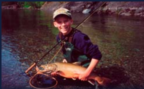
Bull trout, Wade Fredenberg

The Bull trout: native to most major river basins in the Pacific Northwest and western Canada.